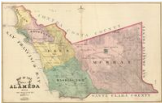
Map Alameda of County, 1878 (Six Townships)